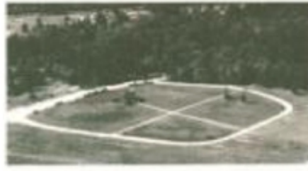
◀ Aerial view of Seven Lakes Cemetery