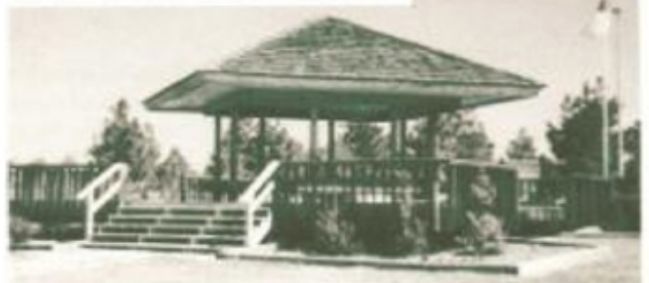
Unique meditation ▼ area with scenic view